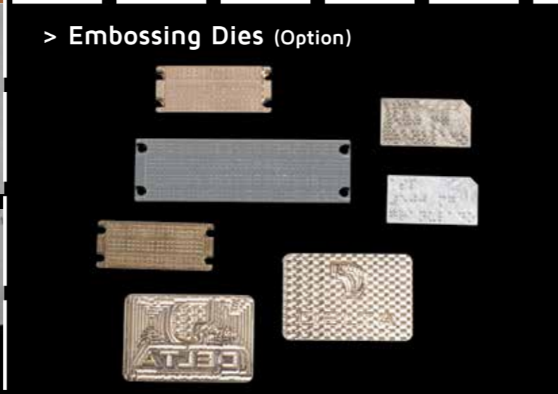
> Embossing Dies (Option)