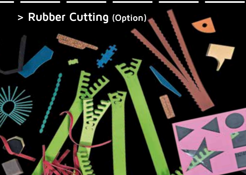
> Rubber Cutting (Option)