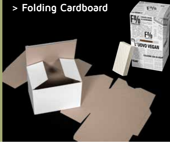
> Folding Cardboard