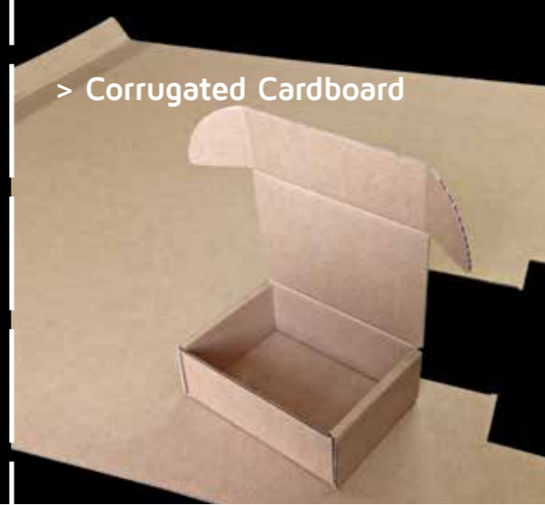
> Corrugated Cardboard