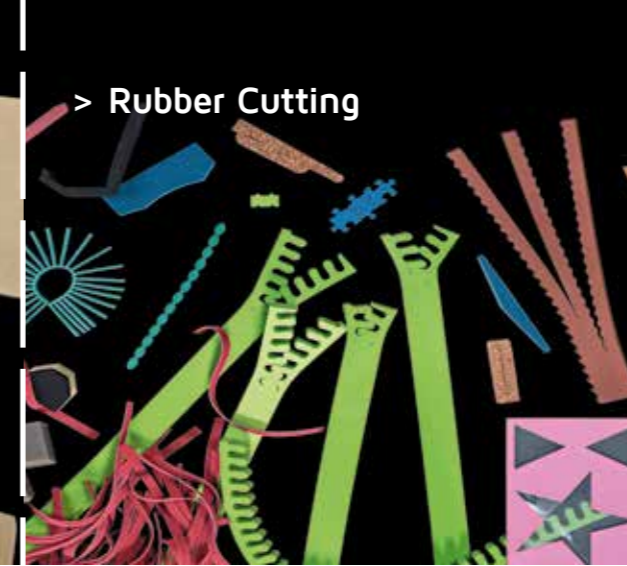
> Rubber Cutting